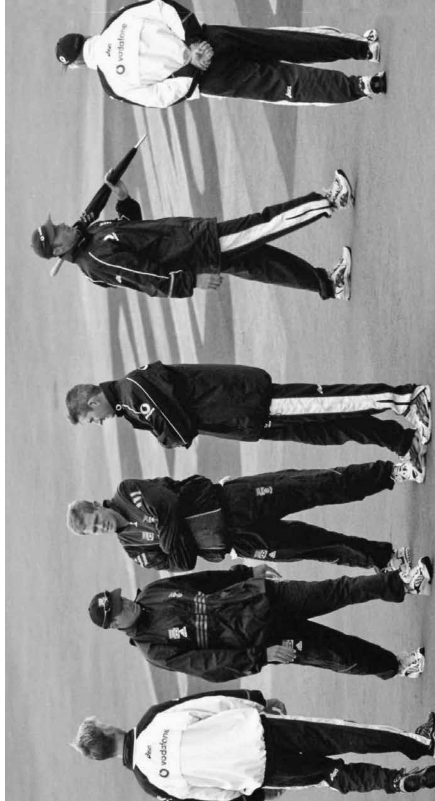
NASSER HUSSAIN AND HANSIE CRONJE INSPECTING THE CENTURION PITCH IN JANUARY 2000